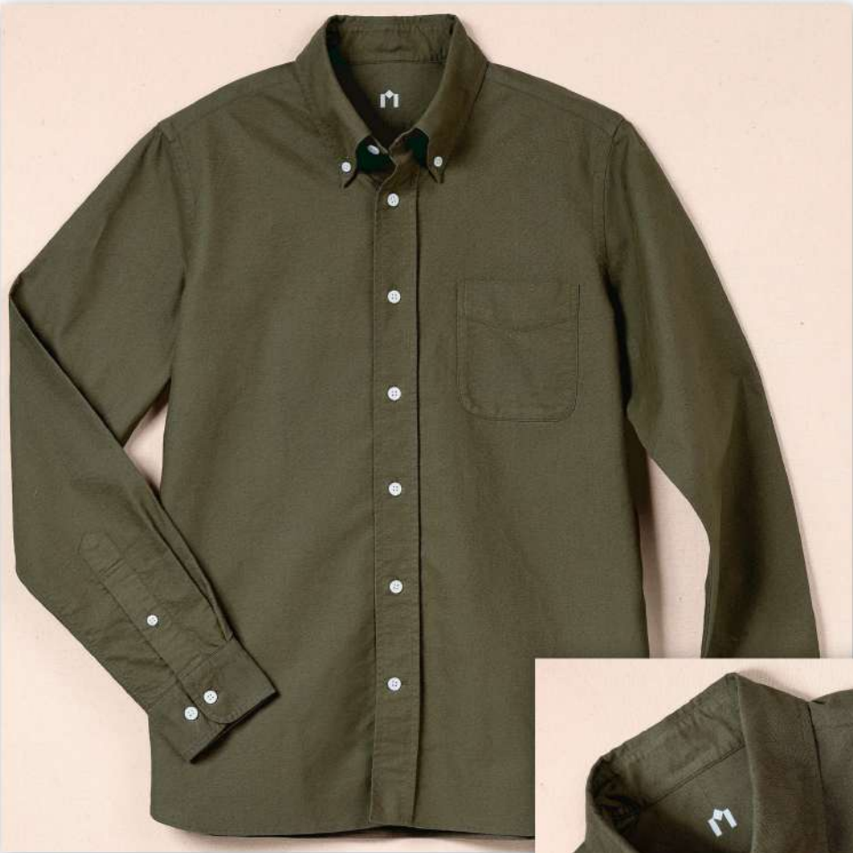
Color - Agave