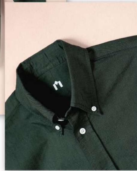
Classic Mid-weight Oxford