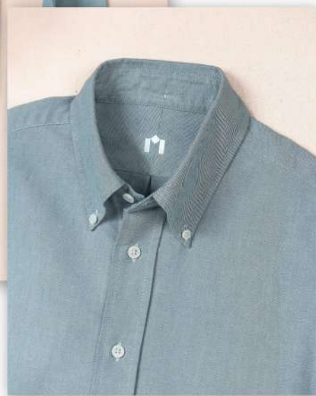
Classic Mid-weight Oxford