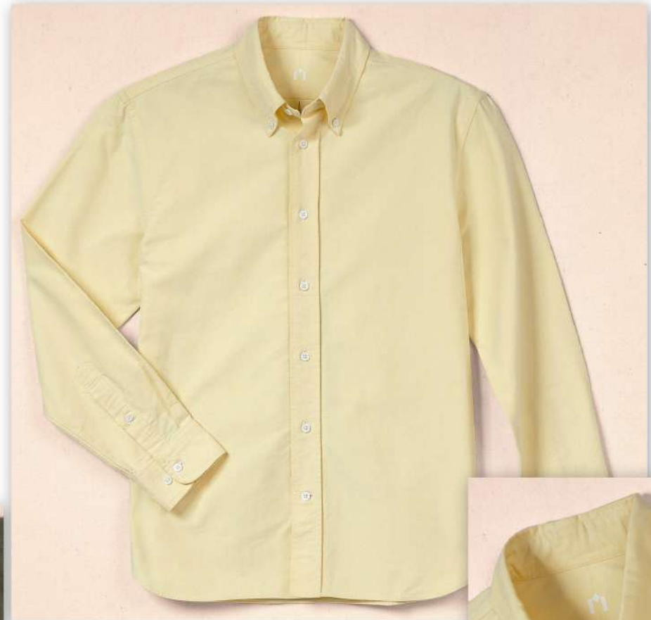
Color - Bisque